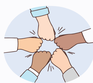
1D Chan Tsz Ching Teacher: CKS

27th September, 2024 I just finished our 3-day camp with my new classmates. After a bunch of team-building activities, I am so tired.